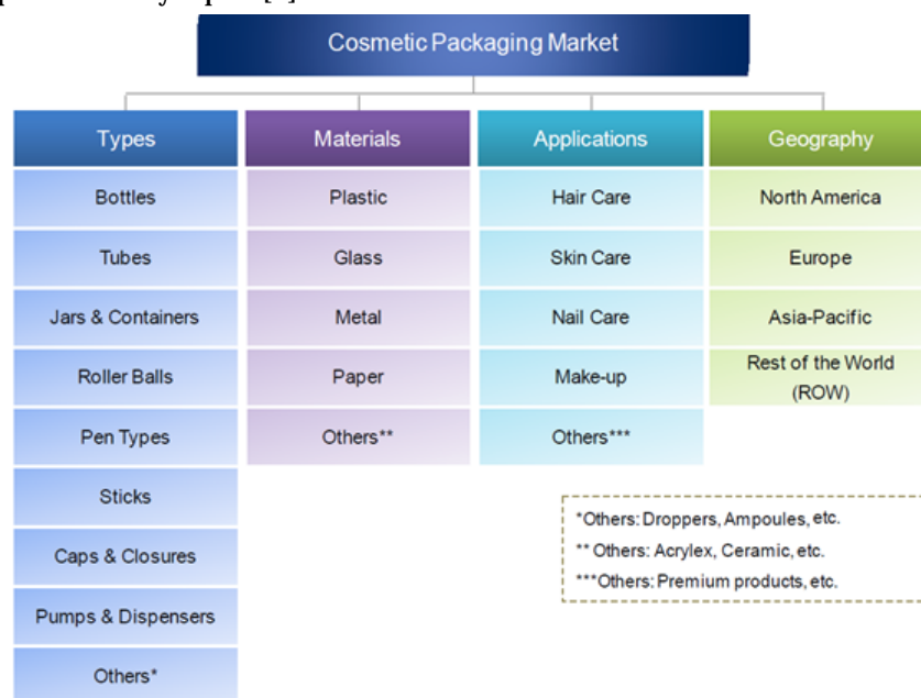
Fig. 1. Cosmetic Packaging Market Segmentation

The cosmetic packaging market can be segmented based on types, applications, materials, and geography. Different types of cosmetic packaging, with various innovations, are introduced in the market. The types of cosmetic packaging material include paper, plastic, glass, metal and others (fig. 1) [12].